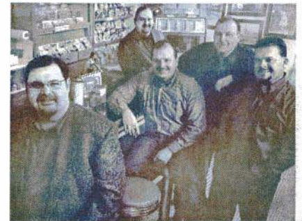
Jr. Sisk & Ramblers Choice Good Traditional Bluegrass Friday