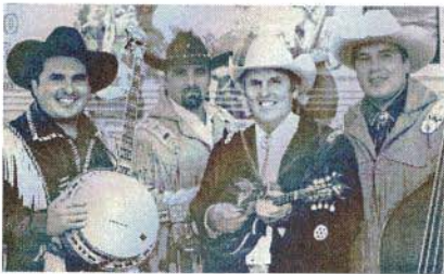
Goldwing Express Very Entertaining! Saturday