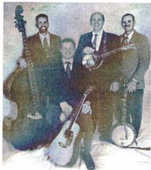
Hart Brothers Saturday