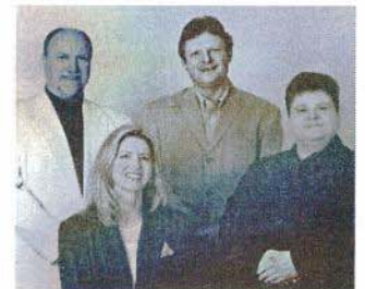
Northwest Territory Friday