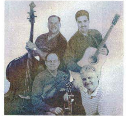
Idletymes Great Entertaining Group & Host Band Both Days

Idletymes 900 Dickel Ave. Parkersburg, WV 304-422-6956